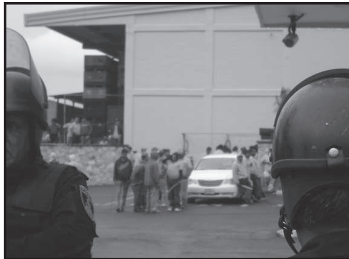
Police and thugs gather outside the Johnson Controls, Inc. (JCI) Interiors plant in Puebla, Mexico in mid-August. On August 16, thugs entered the plant and beat workers backing an independent union.

The hard-won victory at the Resurrection/Interiors plant provides motivation for national and international actors to continue to put pressure on the Mexican government and companies to respect the negotiating process with SME and SNTMMRM. ©