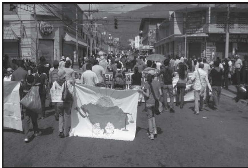
On September 15, the 189th anniversary of Central America's independence from Spain, more than 50,000 people, including many trade union members, marched peacefully in San Pedro Sula, Honduras' second largest city, before police attacked them with teargas and batons.

Fighting for worker justice in the global economy