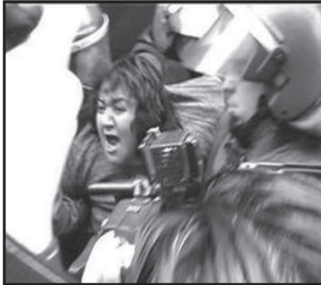
A teacher is surrounded by riot police during an August strike in Tegucigalpa, Honduras over wages. On August 26 and 27, police beat, arrested, and shot tear gas at thousands of protestors calling for the government to resume negotiations with the union, the Association of Secondary Teachers of Honduras (COPEMH), and return back wages.

Police also assaulted band members in Café Guancasco, an FNRP-affiliated ensemble performing at the "What Independence?" concert. Within ten minutes